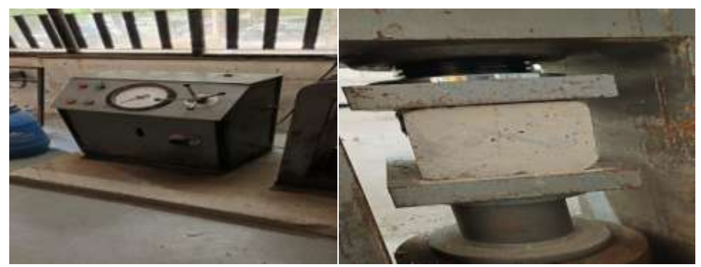
Compressive strength mashin

International Journal of Advances in Engineering and Management (IJAEM) Volume 4, Issue 6 June 2022, pp: 65-69 www.ijaem.net ISSN: 2395-5252